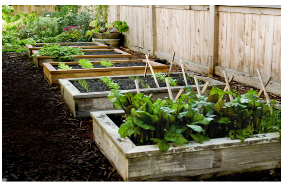
4x4-foot raised beds