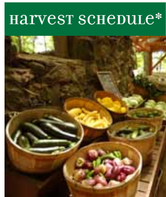
* Actual crop availability will vary

get your VEGETABLES straight from THE FARM